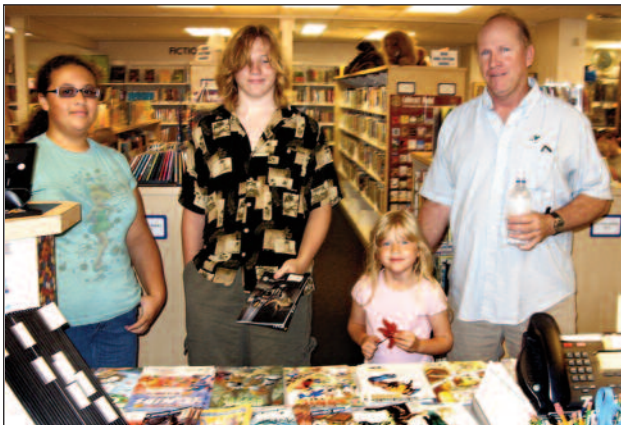
Families enjoyed browsing through stacks of comic books during Free Comic Book Day.

books are an original American art form, created in the early days of the twentieth century. Because they are fun to read, the "funnies" feature a wide range of diverse story lines that capture the imagination of all readers.