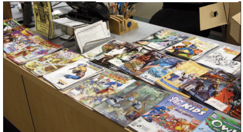
Dozens of comic books appealed to patrons of all ages on May 1st.