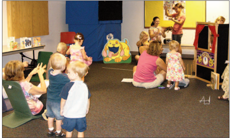
Creative puppet play wows the audience at the Tuesday morning Play and Read program for toddlers.